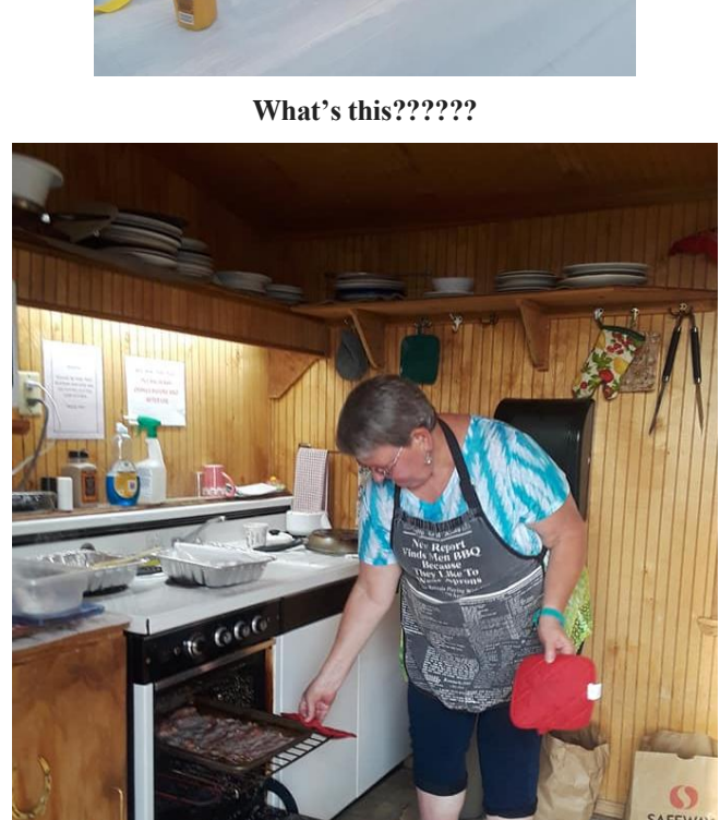
I thought this was a vacation!