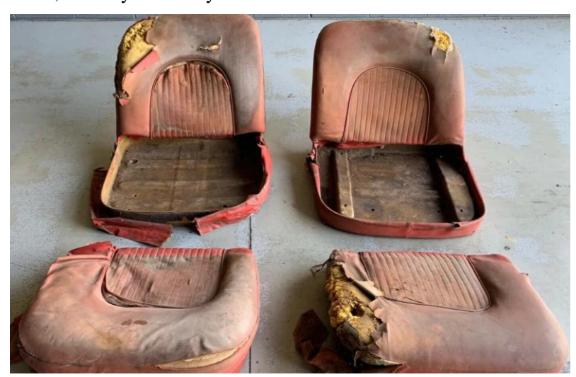
Corvette Prototype Bucket Seats

You can own the original bucket seats fitted to the first-ever Corvette prototype. Technically, these seats were installed in 1952, so they are 68 years old, and boy have they lived a hard life since then.