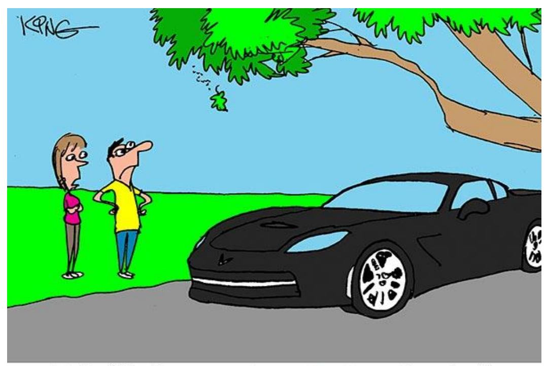
"Fall will be here soon. Every year we go through this. If you don't want leaves to fall on the Corvette, then park it in the garage."