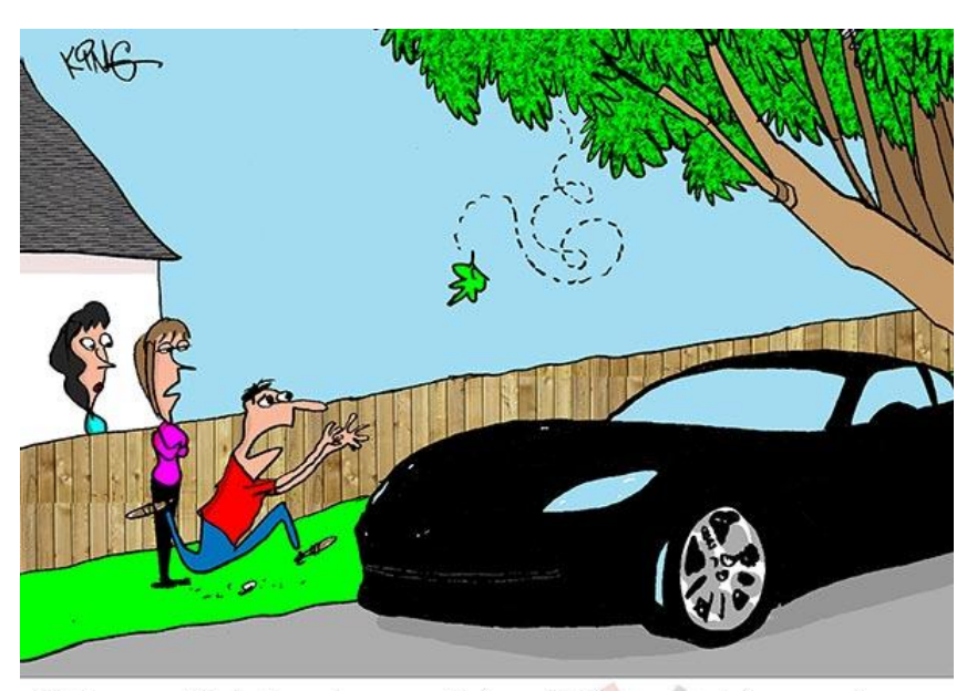
"He won't tolerate anything falling on his precious Corvette. Even if he has to run out to catch every leaf that falls."