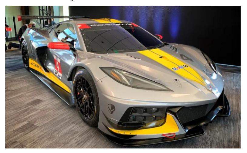
Read the full article here

According to Corvette Racing, the C8.R forgoes the road car's new 495 horsepower 6.2-liter pushrod V-8—dubbed the LT2—for a naturally aspirated 5.5-liter DOHC V-8 with a flat-plane crankshaft.