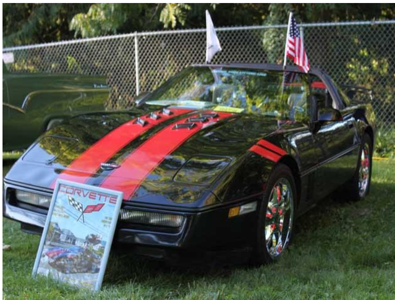
Bryan's 1985 Convertible