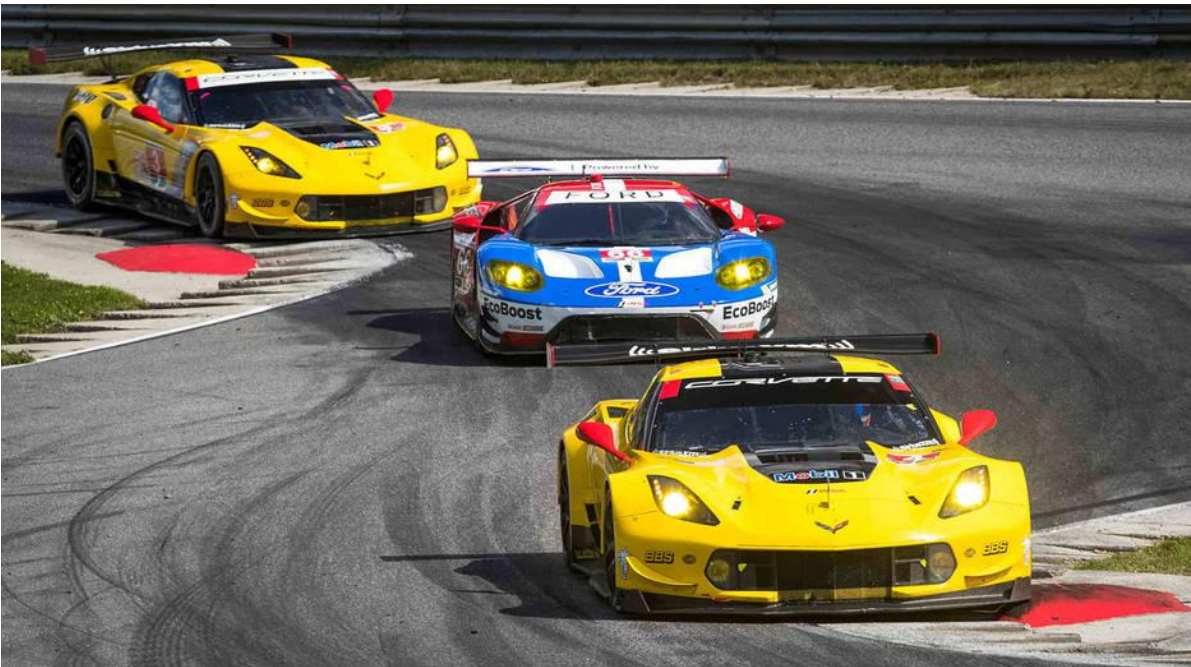
Ford sandwiched by C7-R Corvette at Lime Rock

http://www.corvetteracing.com/2016/corvette-racing-at-lime-rock-park-one-two-finish-on-an-historic-day/