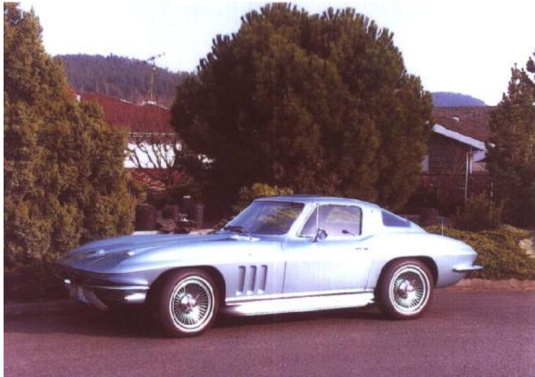
Skip & Rita's 1966 Coupe