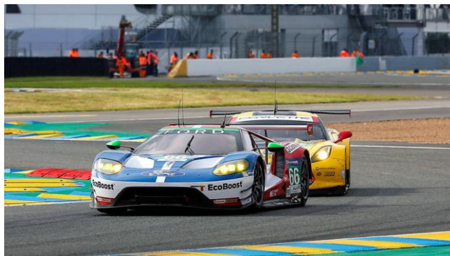
The class winning Ford GT leads the C7-R Corvette at Le Mans