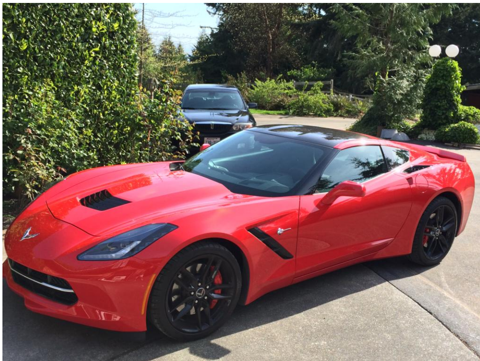
Russ's 2014 C7