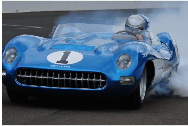
1956 Corvette SR2, experiences a problem at the Indy vintage car races ( http://www.sportscardigest.com/svra-indy-brickyard-invitational-2014-photo-gallery/10/?nngpage=18 )