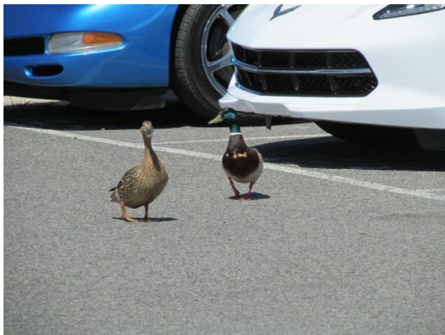
Even ducks like Corvettes!