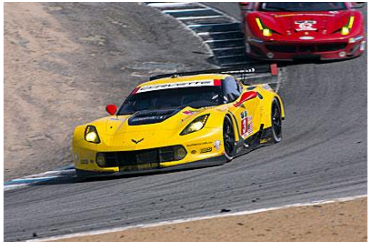
C7-R leads a Ferrari out of the cork screw, Mazda Raceway, Monterey