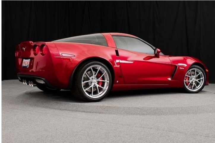
Marlin's 2008 Z06