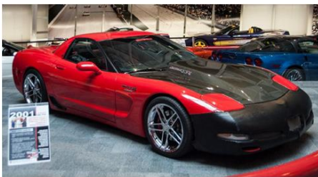
2001 Z06 Corvette Mallett Hammer