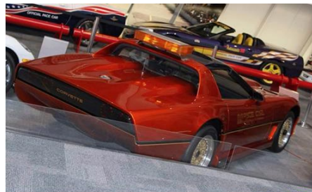
'84 Corvette PPG Pace car