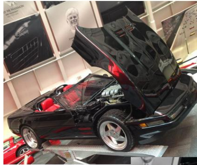
1993 Corvette ZR1 Spyder