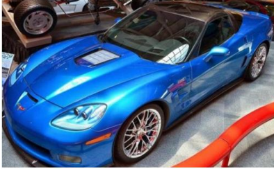
2009 Corvette ZR1 Blue Devil

Here are before and after images from the Museum images: