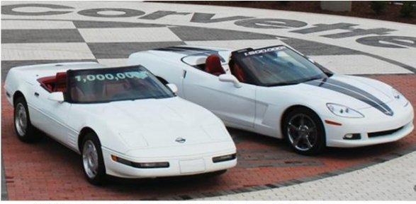
1992 1 millionth Corvette & 2009 1.5 millionth Corvette