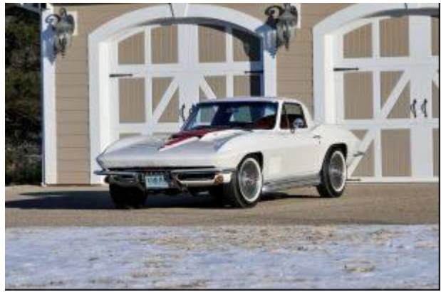
2,996 original mile 1967 BB Coupe