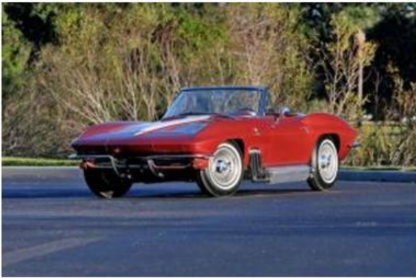
1963 Bunkie Knudsen Corvette

The headline 1967 Chevrolet Corvette Coupe (Lot S128) is likely one of the most well-preserved, lowest-mileage and original big block 1967 Corvettes in existence. The odometer shows 2,996 miles and until its discovery in 2012 it was hidden away in a garage in Colorado Springs for decades. It had only ever been driven by its lifelong-owner and only two other people were ever known to have sat in the driver's seat, and no one ever occupied the passenger seat.