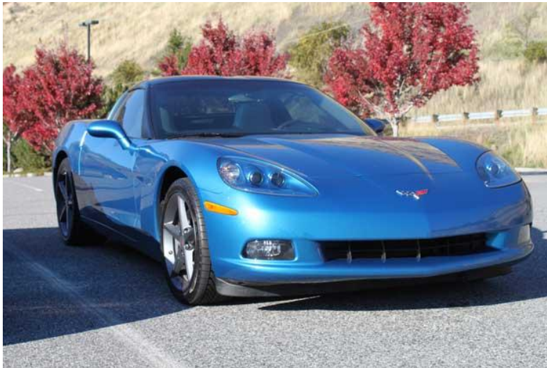
El Presidente's new 2011 Coupe