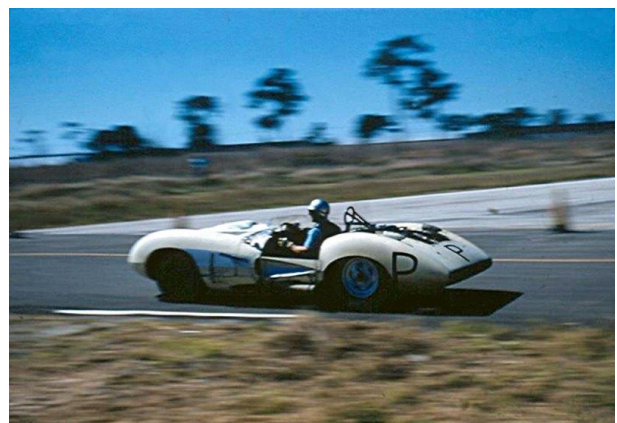
John Fitch Sebring 1957 Corvette SS “P” practice car

Next outing March 15, 61 st 12 Hours of Sebring